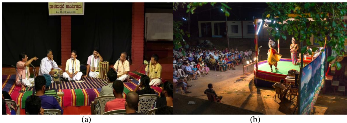
Fig. 2. (a) A baithak ( Taala-maddale ); (b) Open-air Yakshagana performance (top view)