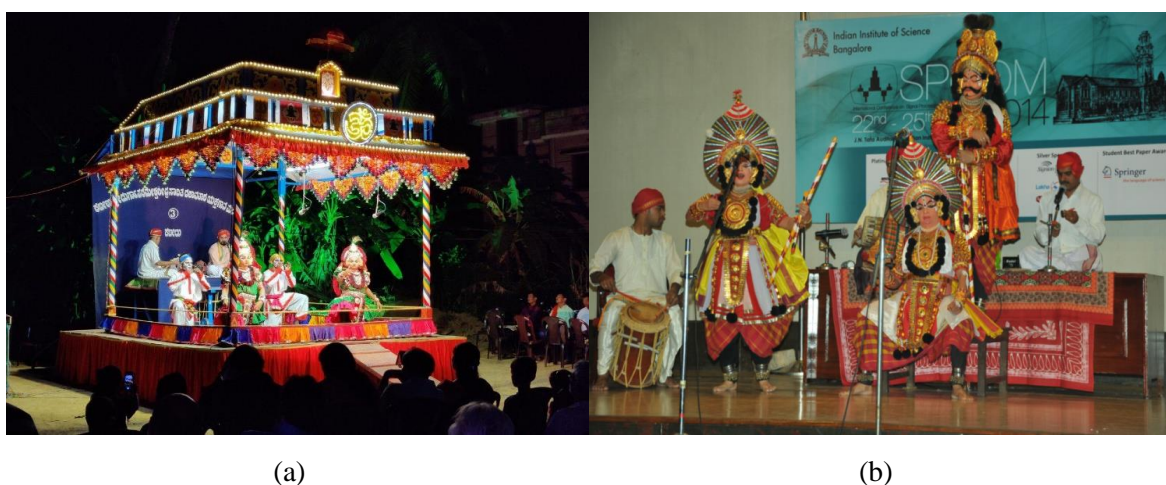
Fig. 5. Shows the (a) Square type rangasthala and (b) Closer view of the performers on rangasthala (sitting Krishna as charioteer, Arjuna standing on Ratha ).

The next equally important and dynamic component is the Rangasthala. Yakshagana is a very rich theatre art form with limited theatrical accessories. Hence, we observed that many engineering skills are being implemented/demonstrated (through expressions and body language) during the performance of Yakshagana without violating the classical basics and tradition of the art. A wooden chair or bench becomes the throne, chariot, garden bench, cot, hunting location, tree, hilltop, and the litho to be used in the forest, depending on the situation. The stage ( rangasthala ) can become a palace, darbar ( oddolaga ), antahapura (royal bedroom), forest, river, lake, garden, patashala ( gurukula ), yaaga shaala ( yajna kunda ), swayamvara place (marriage hall), a battlefield, a sea shore and a crematorium, a cave, all at once. All these striking impressions are created through the emotional songs ( pada ), raga , music, dance, and creative expressions well supported with make-up colours and costumes. Recently lighting effects are also being used. Figure 5 shows the typical rangasthala and a close view of the performers.