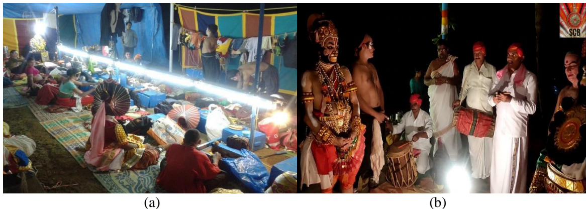
Fig. 4. (a) Yakshagana chowki; (b) Ganapati pooja in chowki

Yakshgana has four main components to be followed for the successful execution of the art: They are Chowki, Himmela, Rangasthala and Mummela. For high-quality performance of the art, there should be good coordination between all these components. An important component of Yakshagana is chowki (green room) Figure 4 , where artists do their make-up, wear costumes, and fix the kireeta (crown), pagade ( kedige , and different types of crowns) ornaments. Depending on the characters assigned. The art has a tradition of getting ready with Ganapati pooja (chowki pooja) before starting the actual performance on rangasthala . After pooja bhagavata seeks god's permission (symbolic) to start the action on rangasthala . Figure 4 shows the typical chowki active scene. The typical Ganapati pooja song will have an impact as a pre-performance exercise or a warm-up for all artists. The speciality of Yakshagana is that each artist has to do his own make-up, wear his own costumes, and do the complete veshagaarika (complete dressing and make-up) himself. Otherwise, he or she will not be considered a professional artist, or he/she is not fully trained to be an artist. There will be minimum help from a helper just for tying, tightening, seeing the balance of wearings and holding the things/dresses. All these activities behind the stage are also a kind of psychological energy stimulant (exercise) for the artists to perform as a group with momentum.