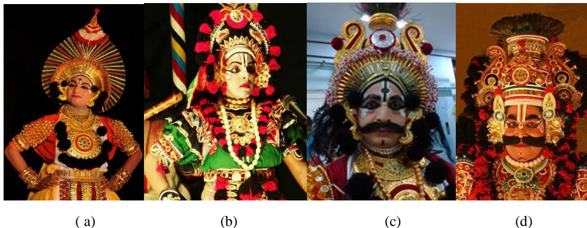
Fig. 1. Typical make-up and costumes for (young) character Krishna; (a) Badagu; (b) Tenku; Rajavesha (King) in (c) Badagu; (d) Tenku

Tenkutittu: The Tenkutittu style is prevalent in Dakshina Kannada, Kasaragod Districts, western parts of Coorg ( Sampaje ), and a few areas of the Udupi district. The influence of Carnatic music is apparent in tenkutittu , as evidenced by the type of maddale and chande used and in bhaagavathike . Yakshagana is influenced more by folk art blended with typical classical music and dance aspects of its own. The dance form in tenkutittu strikes the attention of the audience with dhiginas (jumping spins in the air) or ' Guttu ' kunita , its extravagant rakshasas (demons) and many more, followed by dialogues and scholarly discussions. In tenkutittu , three iconic sets of colours are used: the Raajabanna , the Kaatbanna , and the Sthreebanna . Typical badagu and tenku tittu make-ups and costumes for the character Krishna and Rajavesha is shown in Figure 1.