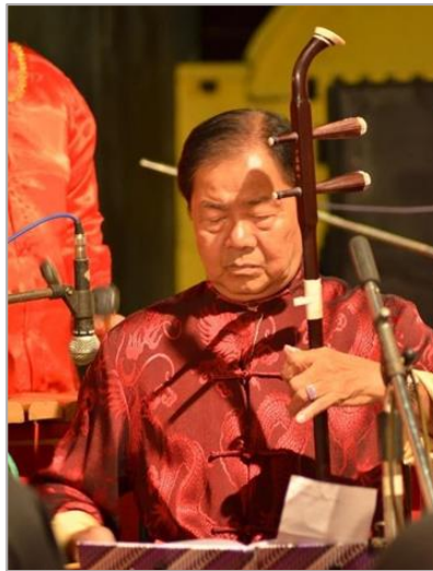
Fig. 3. Erhu Gambang Semarang Player

Lagu lama is a Chinese song that is often presented at the beginning of Gambang Kromong's existence, consisting of old instrumental songs (phobins) and vocal songs [13]. The two types of old songs combine Chinese and Indonesian music [14], [15]. Meanwhile, the lagu sayur is a song in the form of vocals accompanied by music often performed in Gambang Kromong performances. Because it features Gambang Kromong songs, at first Gambang Semarang had musical characteristics similar to Gambang Kromong. However, the resemblance faded with the performance of memorable songs from Gambang Semarang, Central Javanese folk songs, keroncong songs, and Javanese pop songs [16]. At the beginning of the development of this music, the nuances of Betawi-Chinese and Javanese-Chinese are pretty strong. This is shown in the erhu performance or stringed instrument originating from China, as shown in Figure 3.