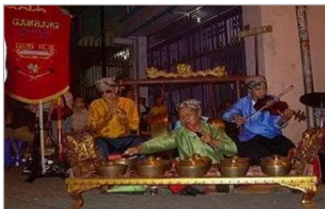
Fig. 2. Semarang Gambang Center Group

At the beginning of the appearance of Gambang Semarang, there were two types of the repertoire of songs contained in the Gambang Kromong tradition, namely the lagu lama and the lagu sayur [12].