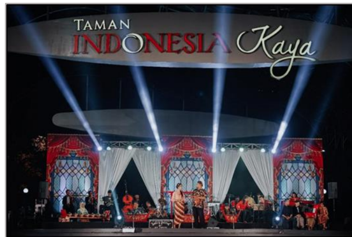
Fig. 6. Main Character Dadung Kepuntir GSAC

imagination to dissolve in the atmosphere of the city of Semarang. Social practices that are close to the community are displayed at the GSAC Dadung Kepuntir performance.