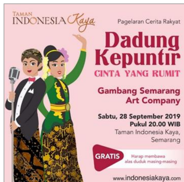
Fig. 4. GSAC Performance Poster