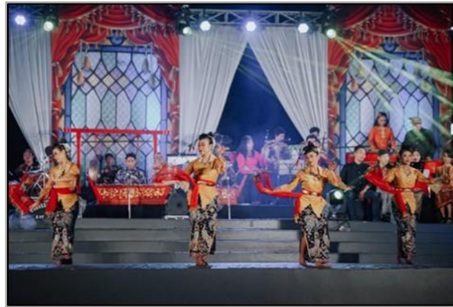
Fig. 5. GSAC Dadung Kepuntir Story Performance

culminated in a fierce battle. The climax scene was closed with the resolution of the dispute by his friend Karyanto. Then the scene continued with the appearance of dancers and music as the closing of the Gambang Semarang performance entitled Dadung Kepuntir, which Gambang Semarang Art Company performed. The scenes in the GSAC performance are interspersed with some music and dance, sometimes overlapping with the comedy-drama. GSAC brings Dadung Kepuntir's story as a contemporary musical drama performance that considers today's contextual. It can be seen from the several choices of music presented, GSAC deliberately includes popular songs at this time.