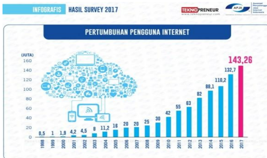
Fig. 1. The Graph of increasing social media users in Indonesia [1]

Today, humans have experienced changes in terms of communication. Changes in the way of communication is influenced by the rapid advances in technology in this era of modernization. After the development of the internet, commonly referred to as New Wave Media or New Media, it is a beginning of the birth of changes in human communication today. The Internet creates a way of communicating using Social Media, it is not surprising that currently Social Media is becoming a new lifestyle among Indonesians, it can be seen from Fig. 1 which is shown an increasing social media users in Indonesia by the Association of Indonesian Internet Service Providers (APJII).